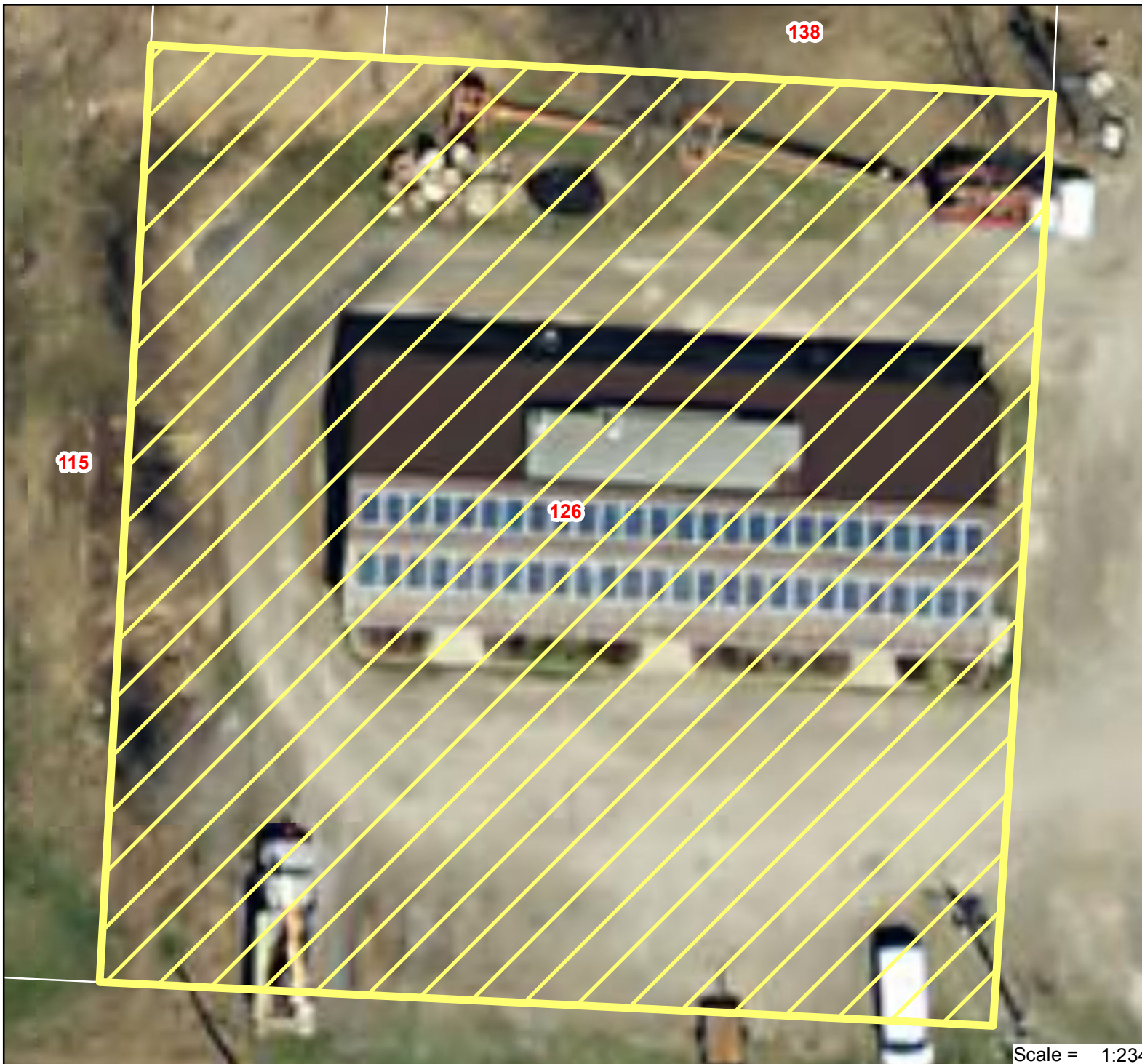
SUBJECT LANDS KEY MAP (Approximate Area)