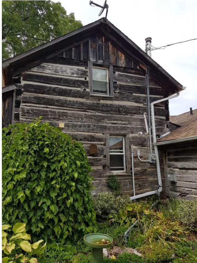
Existing conditions of Squire cabin