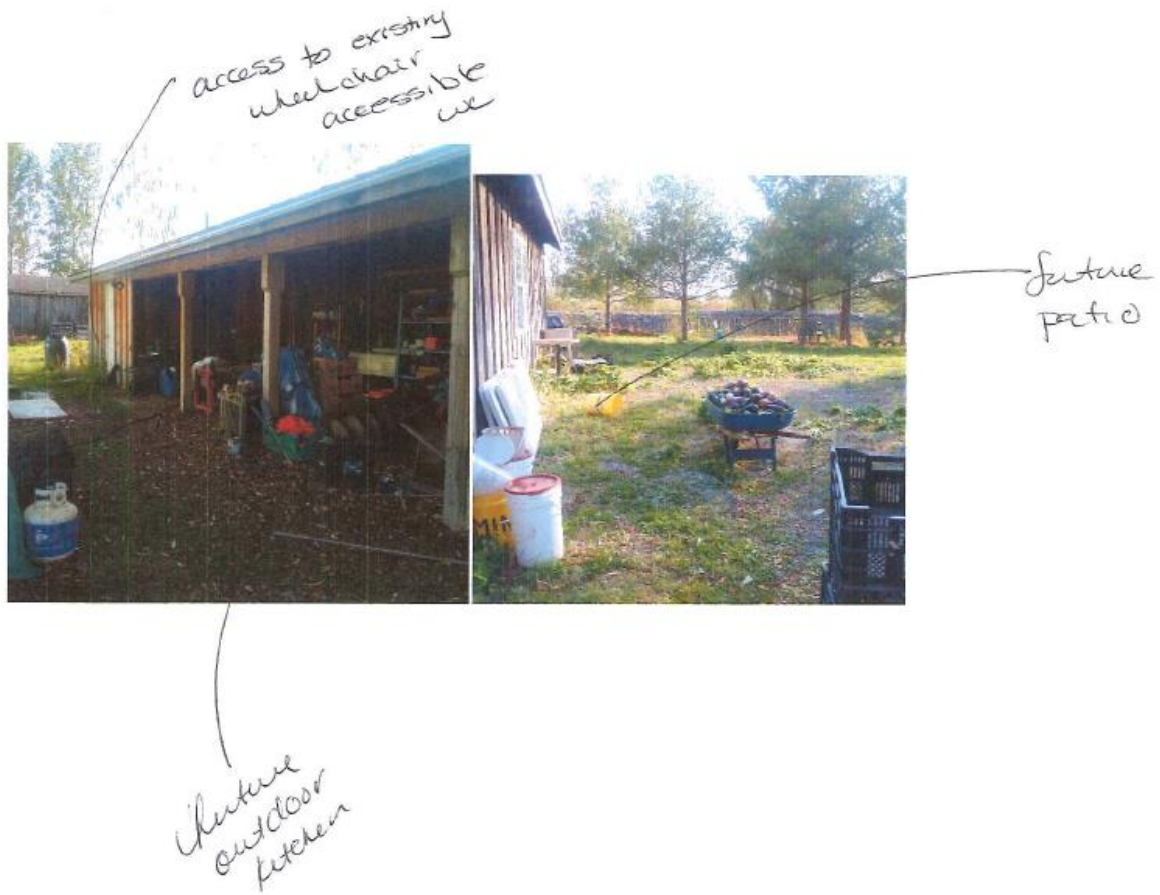
Existing exterior of commercial kitchen