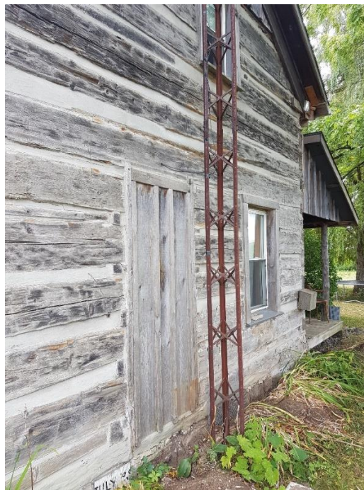
Existing conditions of Squire cabin