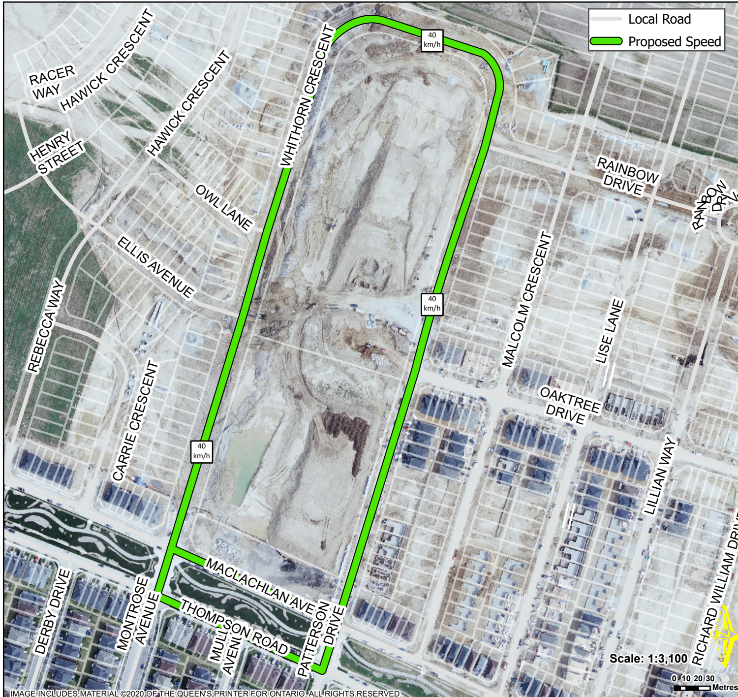
IMAGE INCLUDES MATERIAL ©2020 OF THE QUEEN'S PRINTER FOR ONTARIO, ALL RIGHTS RESERVED.