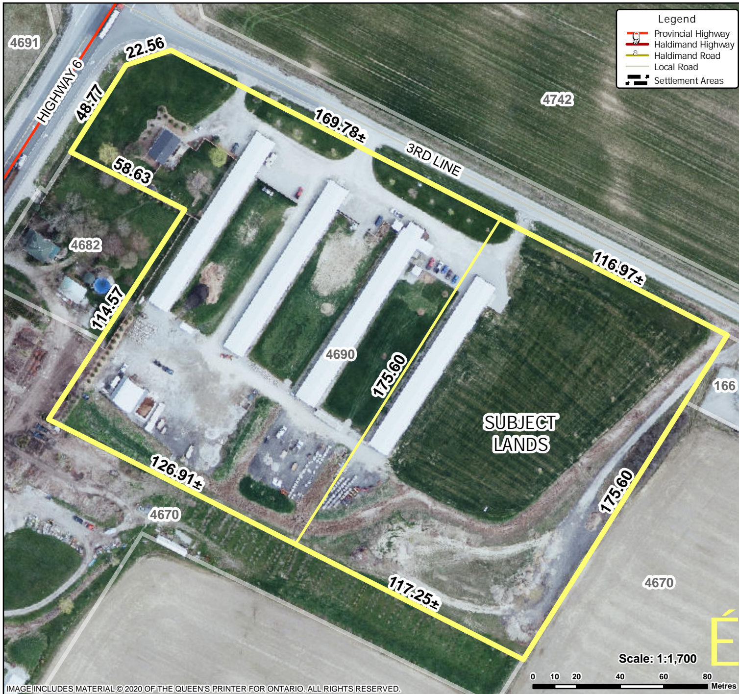
IMAGE INCLUDES MATERIAL © 2020 OF THE QUEEN'S PRINTER FOR ONTARIO. ALL RIGHTS RESERVED.