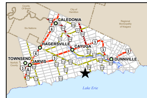
IMAGE INCLUDES MATERIAL © 2020 OF THE QUEEN'S PRINTER FOR ONTARIO. ALL RIGHTS RESERVED.

PREPARED BY HALDIMAND COUNTY PLANNING & DEVELOPMENT DIVISION, GIS SECTION. Mar 2025