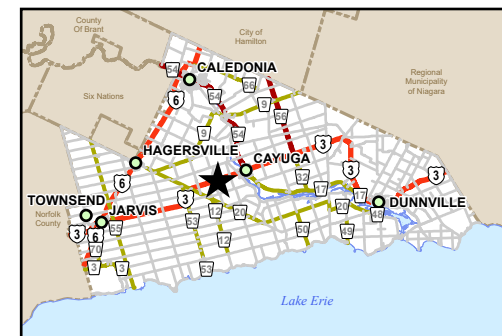
IMAGE INCLUDES MATERIAL © 2020 OF THE QUEEN'S PRINTER FOR ONTARIO. ALL RIGHTS RESERVED.