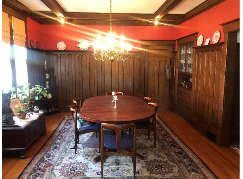
Figure 5: White oak panelling and elm ceiling beams