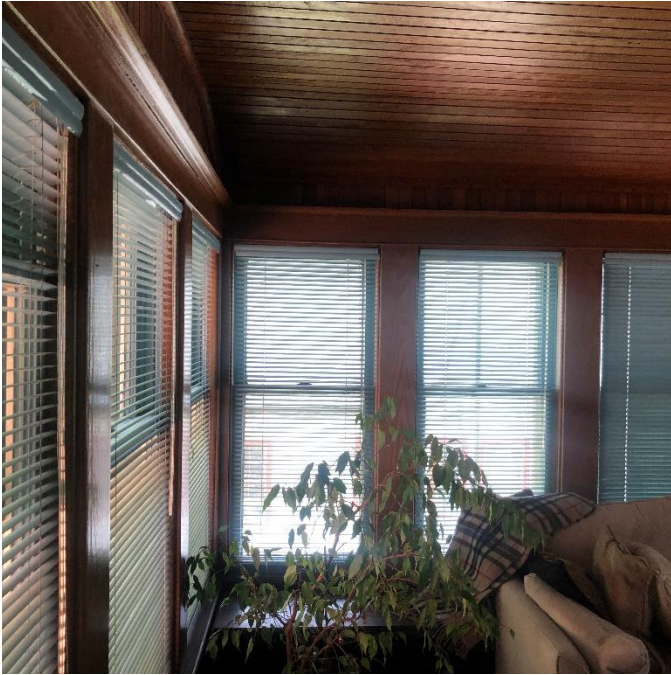
Figure 4: Ceiling with oak slats