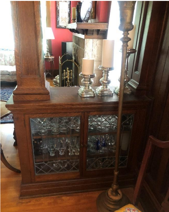
Figure 6: Built-in oak cabinetry