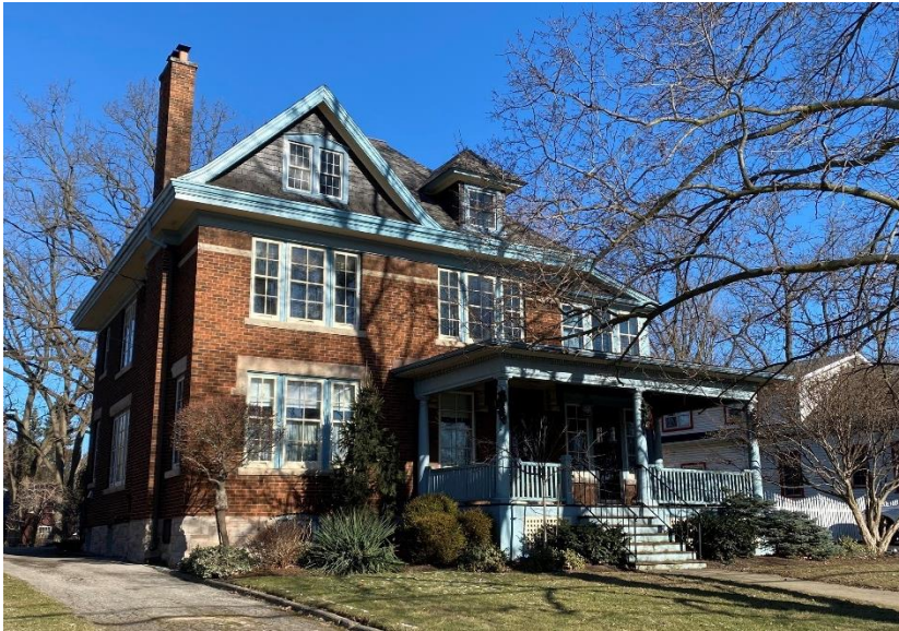
Figure 1: 212 Caithness St E, Caledonia - Front façade