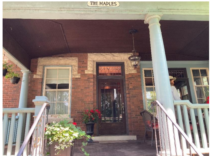
Figure 3: Front door with leaded glass windows