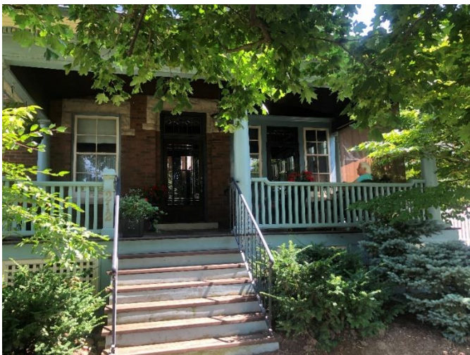
Figure 2: Porch and sill stonework above windows at front façade