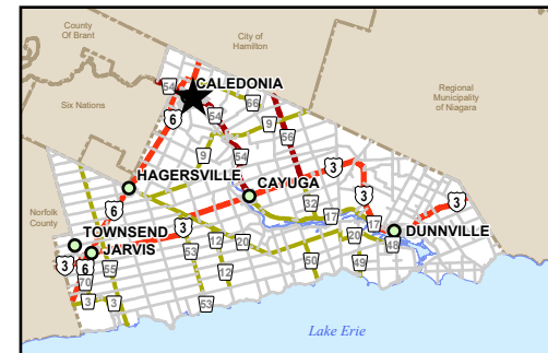
IMAGE INCLUDES MATERIAL ©2020 OF THE QUEEN'S PRINTER FOR ONTARIO, ALL RIGHTS RESERVED.