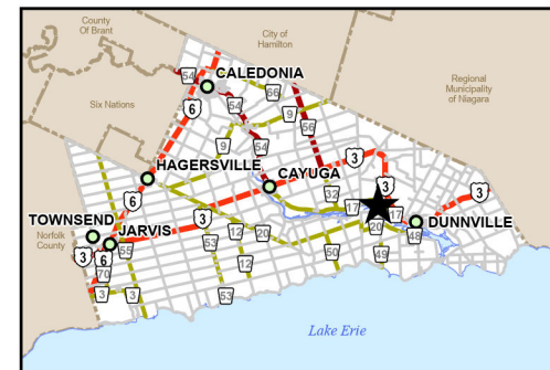
IMAGE INCLUDES MATERIAL ©2020 OF THE QUEEN'S PRINTER FOR ONTARIO, ALL RIGHTS RESERVED.