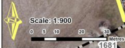
IMAGE INCLUDES MATERIAL © 2020 OF THE QUEEN'S PRINTER FOR ONTARIO. ALL RIGHTS RESERVED.