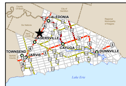
IMAGE INCLUDES MATERIAL © 2015 OF THE QUEEN'S PRINTER FOR ONTARIO. ALL RIGHTS RESERVED.