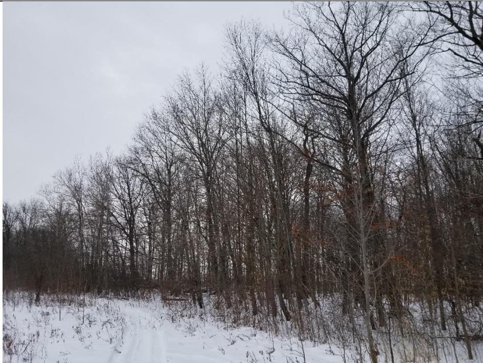
Picture 6: View of Significant Woodlands complex extending onto the adjacent property to the north.