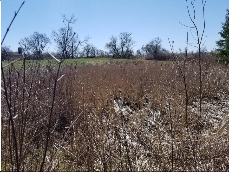
Picture 11: Seasonal pond located within 30m of the southeast corner of the Significant Woodlands.