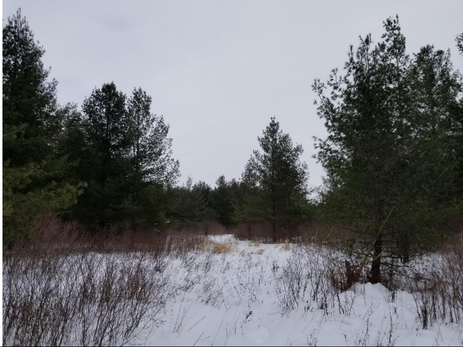
Picture 7: View of the gap in the White Pine plantation greater than 20m excluded from the Significant Woodlands area calculation.