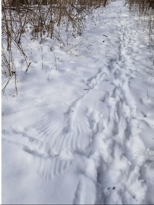
Picture 9: Large bird prints in the snow along the trail through the White Pine plantation.