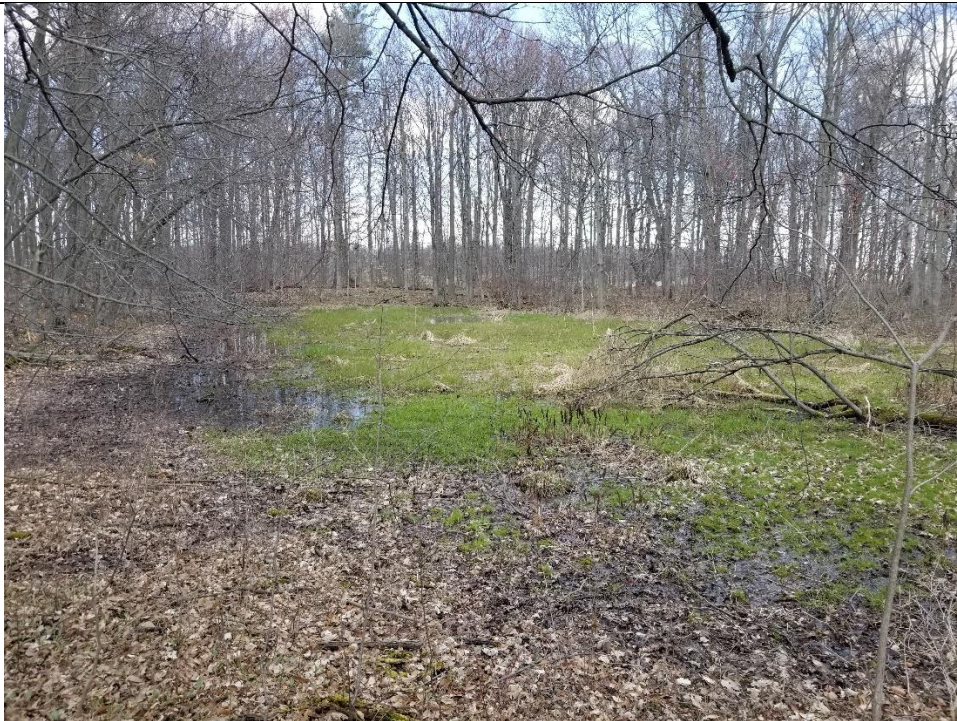
Picture 12: Seasonal pond located within the northern corner of the Significant Woodlands.