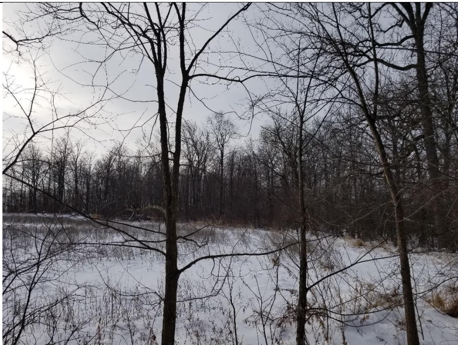
Picture 4: View of Significant Woodlands complex extending onto the adjacent property to the south.