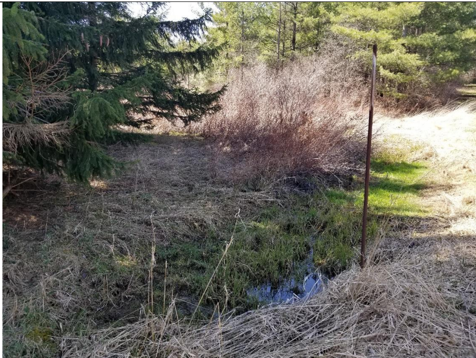
Picture 10: Intermittent stream running through the east side of the Significant Woodlands.