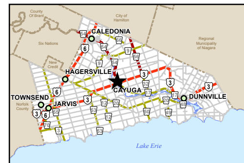
IMAGE INCLUDES MATERIAL © 2015 OF THE QUEEN'S PRINTER FOR ONTARIO. ALL RIGHTS RESERVED.