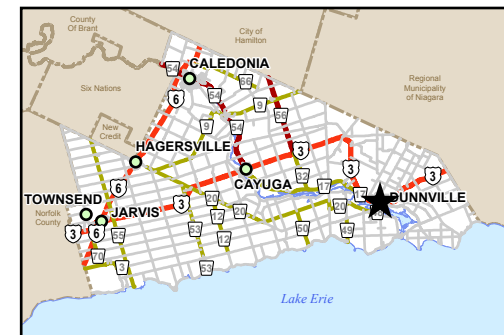
IMAGE INCLUDES MATERIAL © 2015 OF THE QUEEN'S PRINTER FOR ONTARIO. ALL RIGHTS RESERVED.