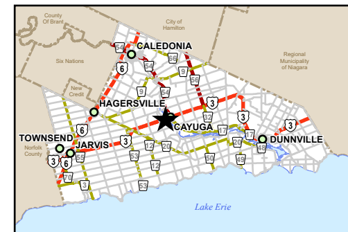
IMAGE INCLUDES MATERIAL © 2015 OF THE QUEEN'S PRINTER FOR ONTARIO. ALL RIGHTS RESERVED.