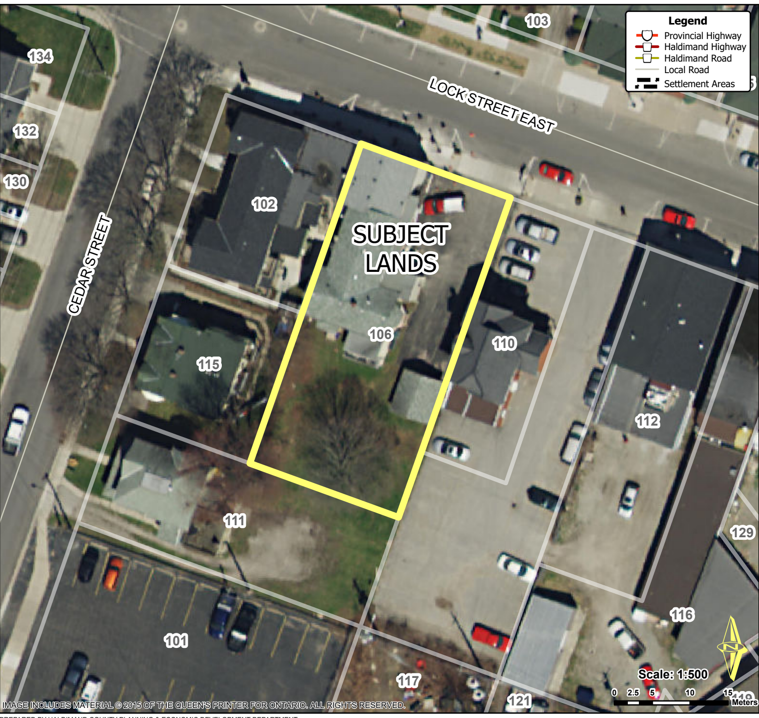
PREPARED BY HALDIMAND COUNTY PLANNING & ECONOMIC DEVELOPMENT DEPARTMENT, GIS & GRAPHICS SECTION. Feb 2022