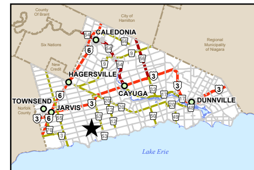
IMAGE INCLUDES MATERIAL © 2015 OF THE QUEEN'S PRINTER FOR ONTARIO. ALL RIGHTS RESERVED.