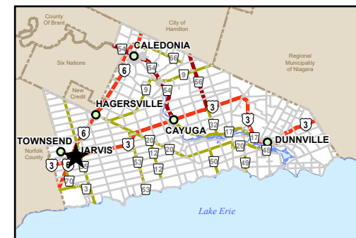
IMAGE INCLUDES MATERIAL © 2015 OF THE QUEEN'S PRINTER FOR ONTARIO. ALL RIGHTS RESERVED.