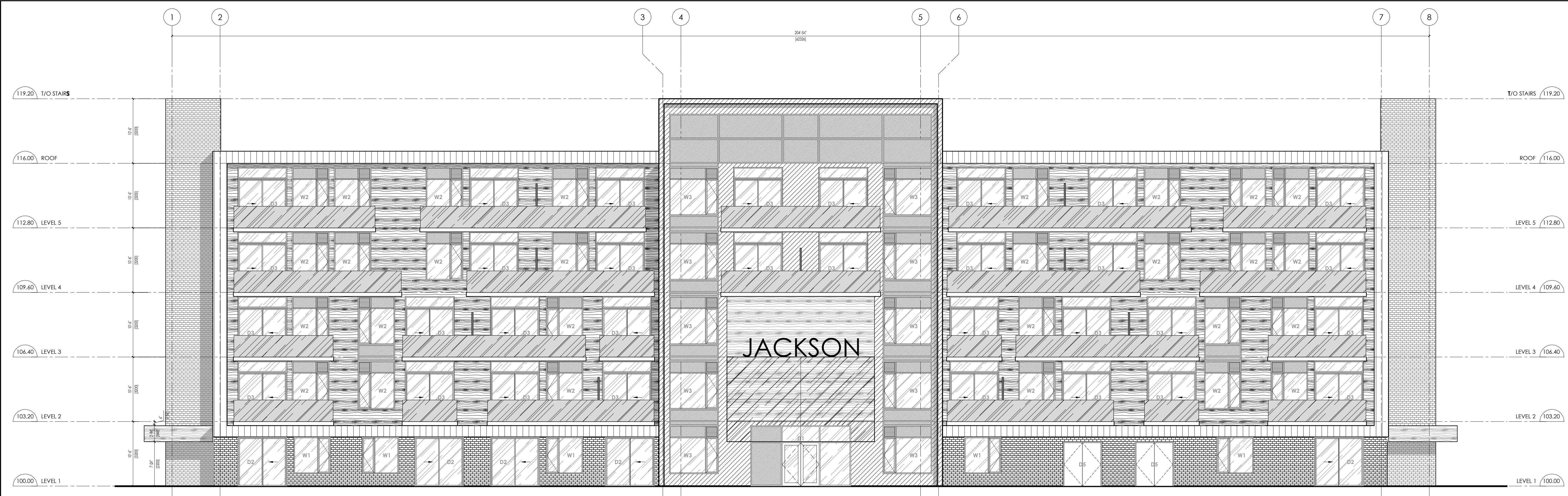
1 A3.1 ELEVATION 0 1 2 5m