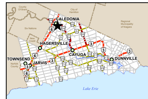
IMAGE INCLUDES MATERIAL © 2015 OF THE QUEEN'S PRINTER FOR ONTARIO. ALL RIGHTS RESERVED.