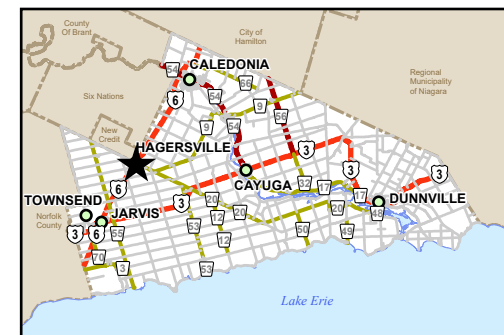
IMAGE INCLUDES MATERIAL © 2015 OF THE QUEEN'S PRINTER FOR ONTARIO. ALL RIGHTS RESERVED.