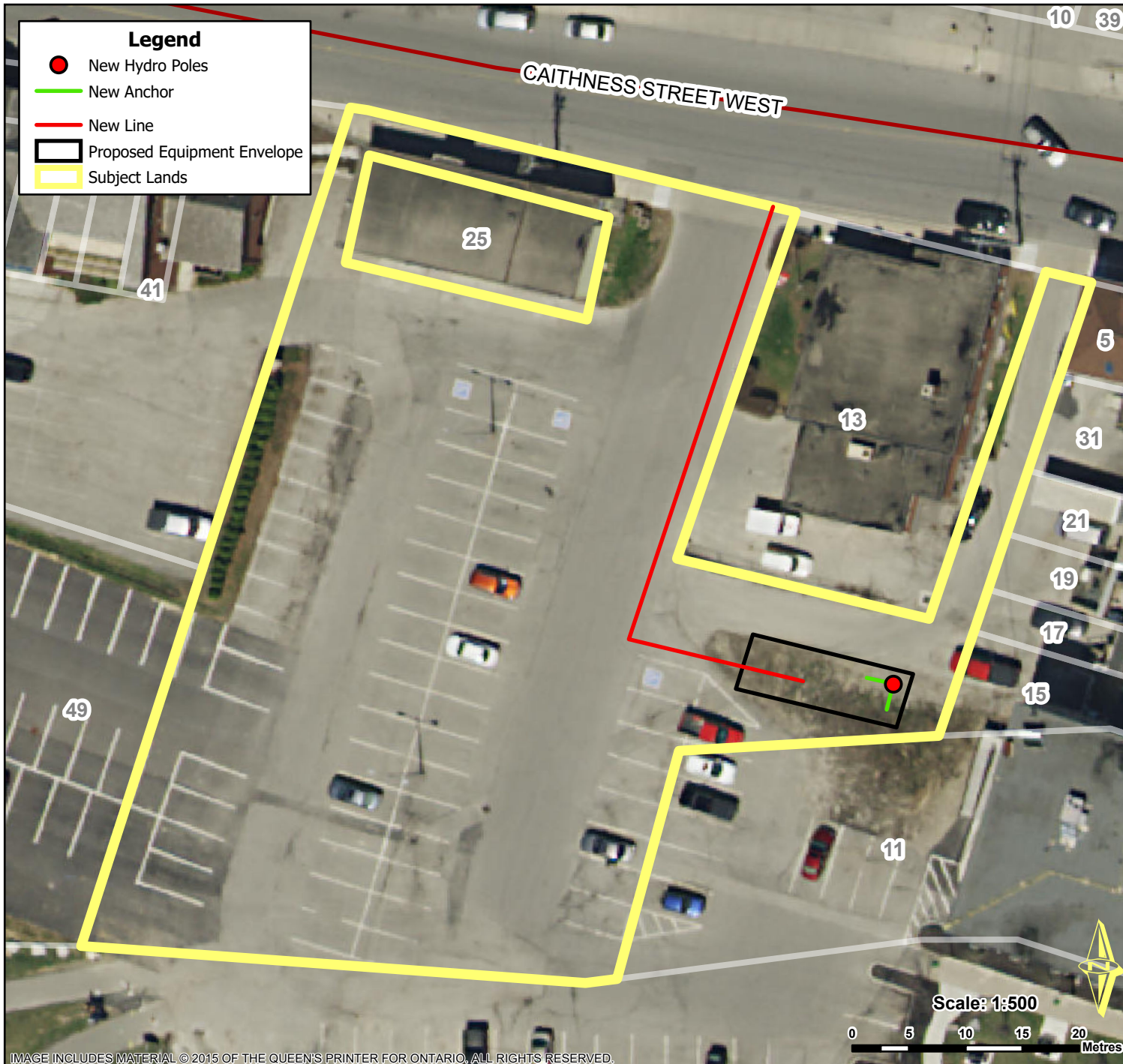
IMAGE INCLUDES MATERIAL © 2015 OF THE QUEEN'S PRINTER FOR ONTARIO. ALL RIGHTS RESERVED.

PREPARED BY HALDIMAND COUNTY PLANNING & ECONOMIC DEVELOPMENT DEPARTMENT, GIS & GRAPHICS SECTION. Mar 2020