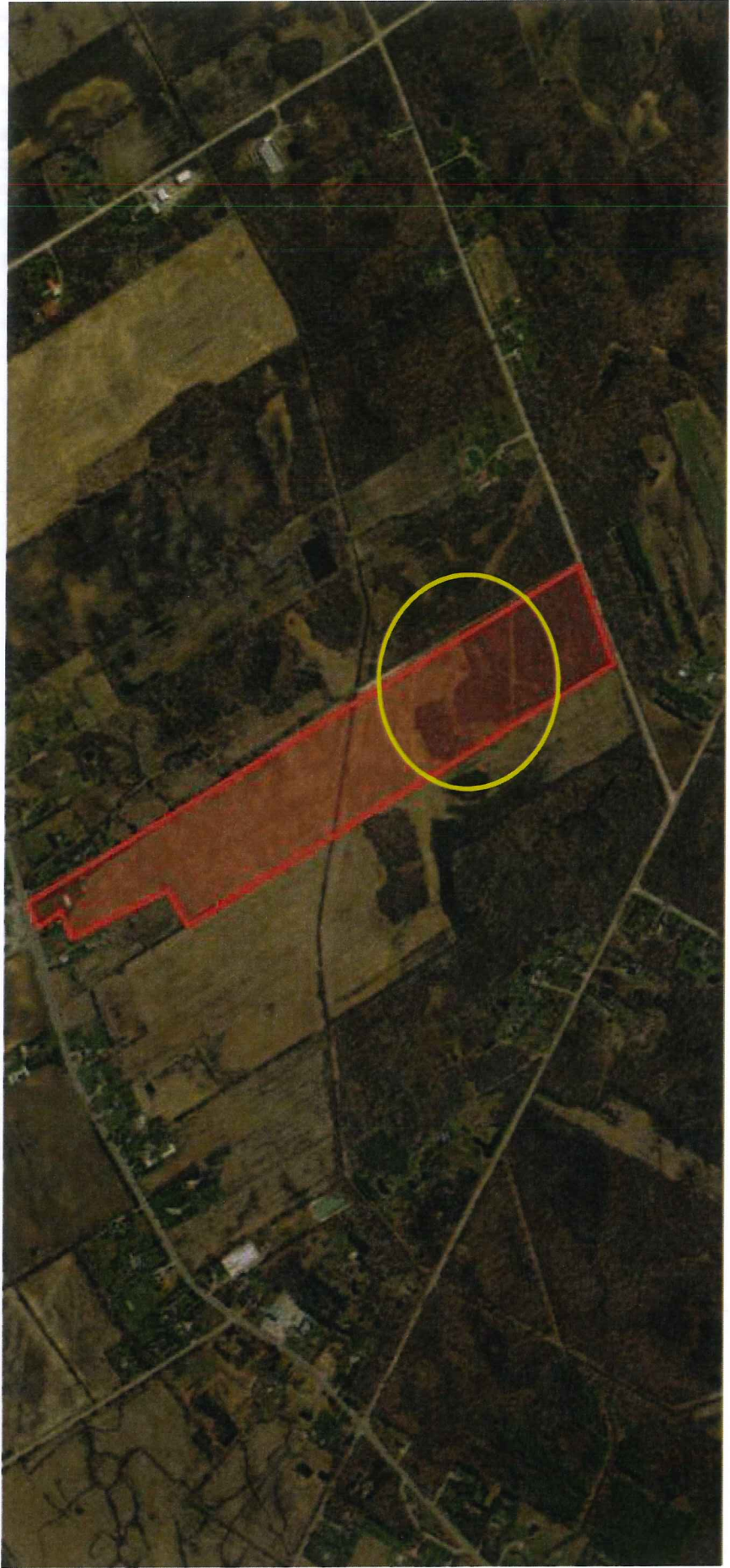
Figure 2: Specific Site Location