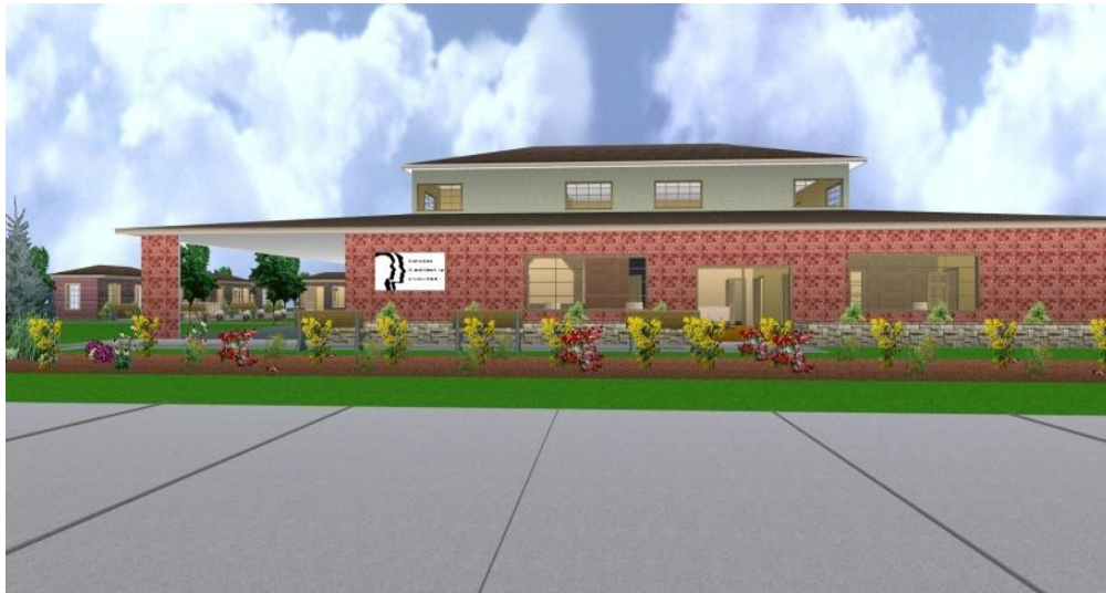
Proposed Front view