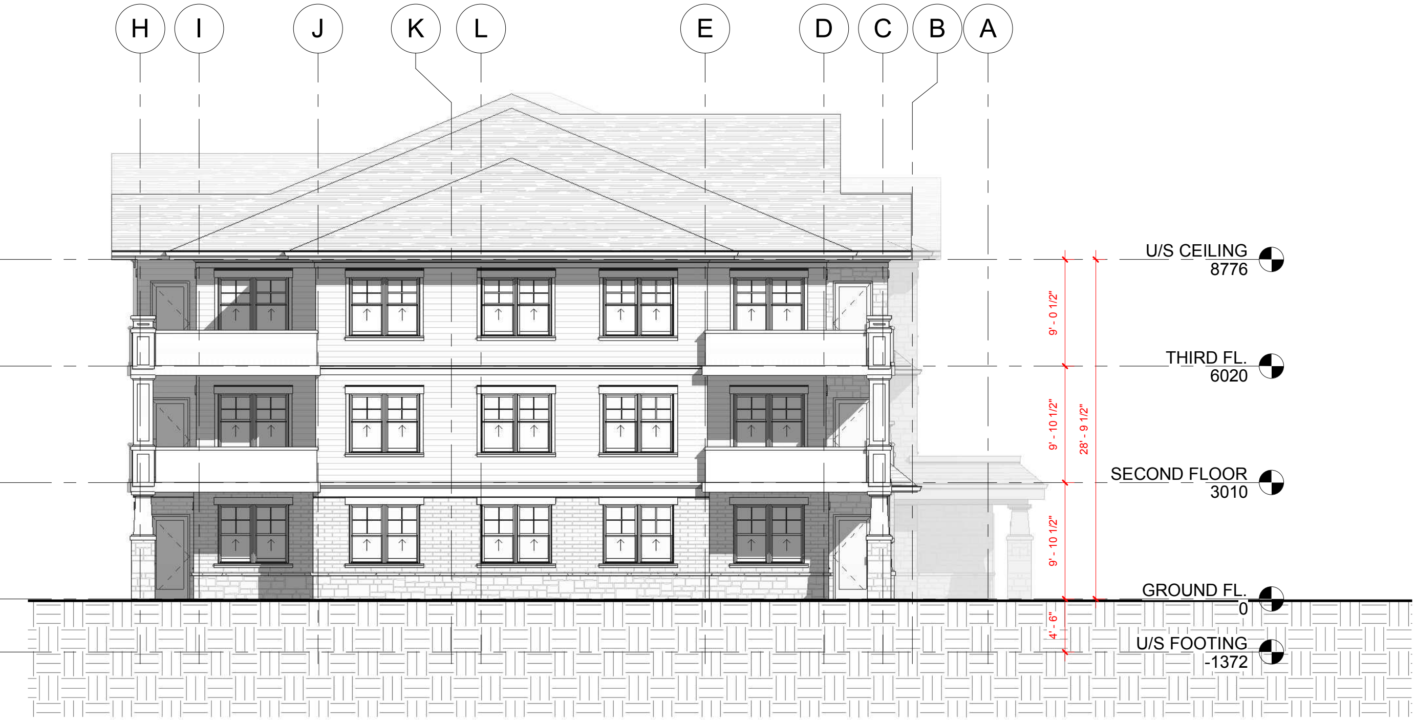
3 PROPOSED EAST ELEVATION 1 : 100