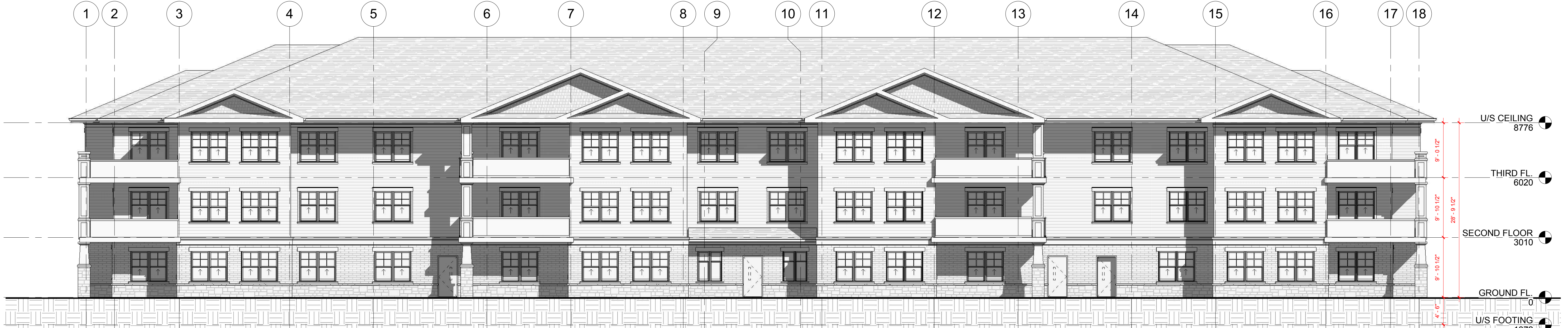
2 PROPOSED SOUTH ELEVATION 1 : 100