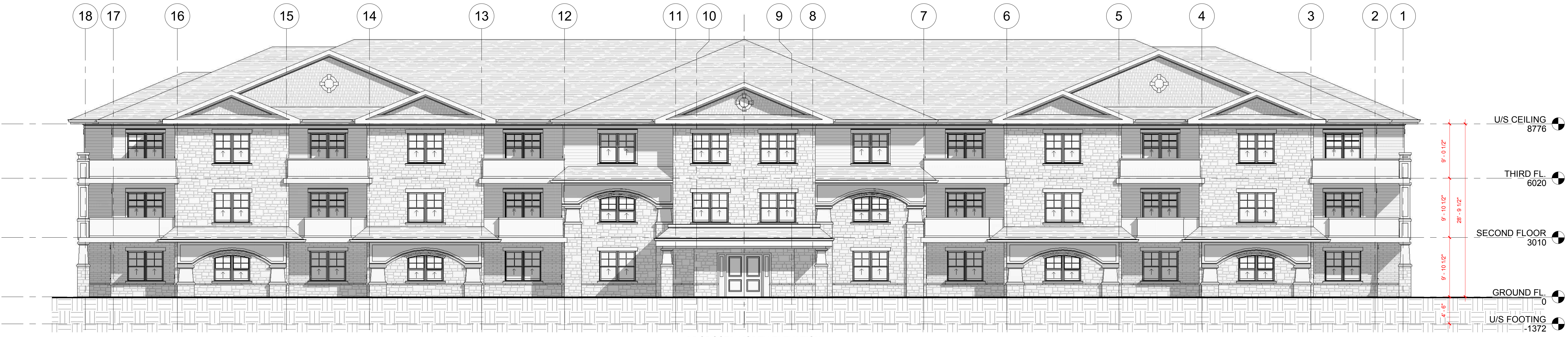
1 PROPOSED NORTH ELEVATION 1 : 100