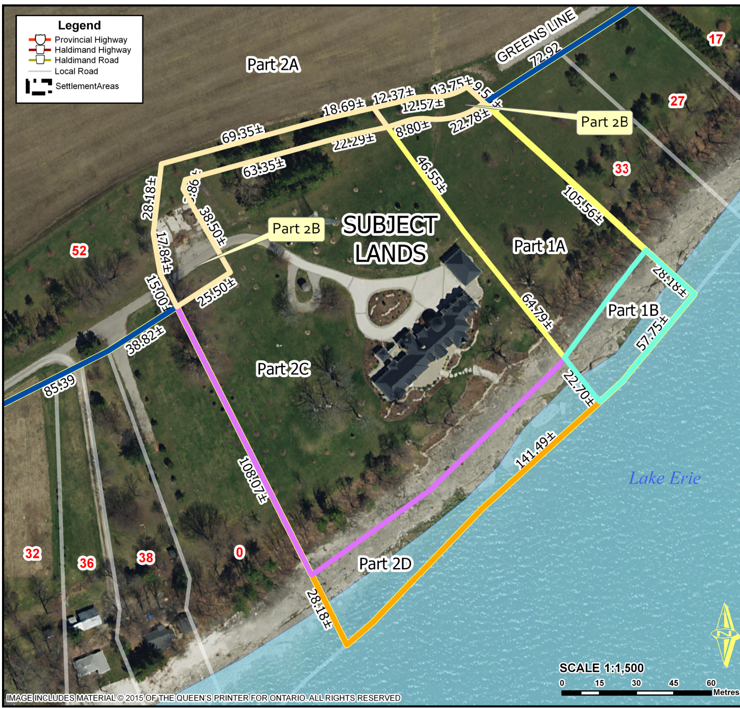
PDD-03-2019, Attachment 4