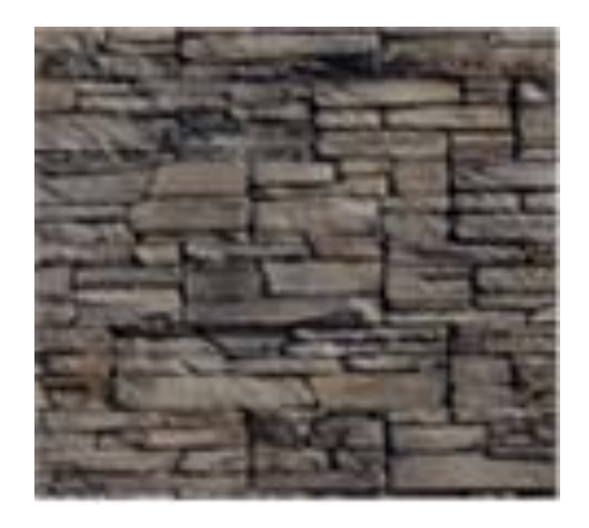
Sample of siding to be applied and stonework to lower portion of façade.